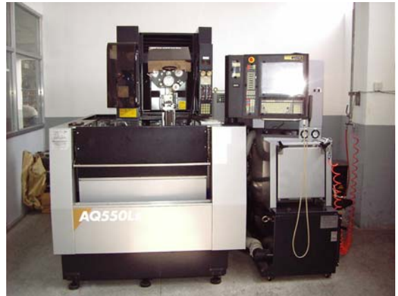
NC-Wire Cut Machine