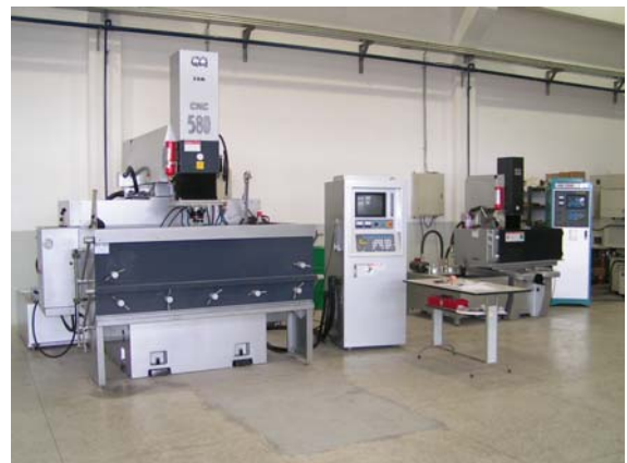
Electric Discharge Machine