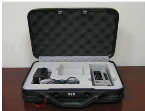
Digital Thickness Measurer