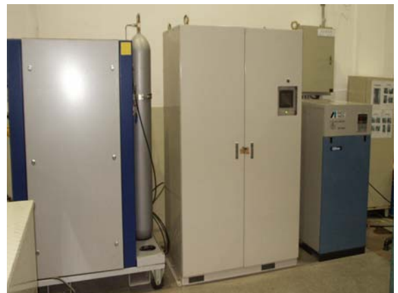
Nitrogen gas injection system