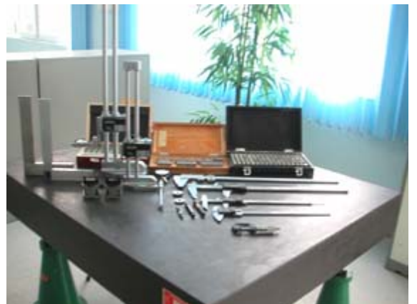
Usual measuring equipments