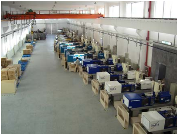
Layout view of small type injection moulding machine area