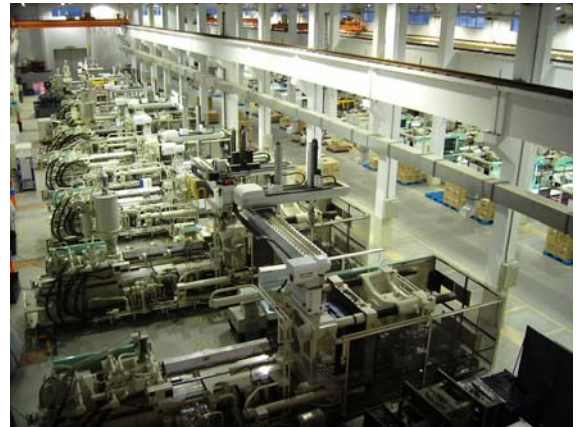
Layout view of large type injection moulding machine area