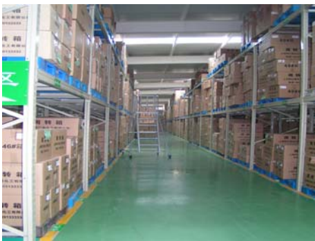
Completed Products Warehouse (4500m 2 )