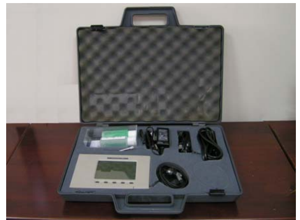
Supersonic wave Thickness meter