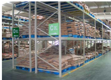
Raw Materials Warehouse (2000m 2 )