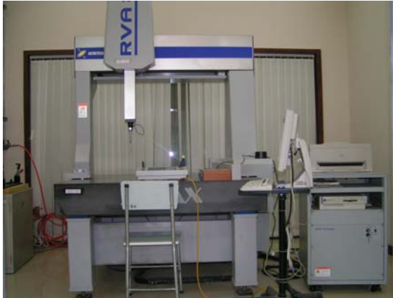
Digital 3D Measuring Instrument