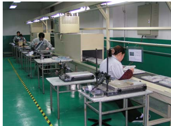
Printing auto lines