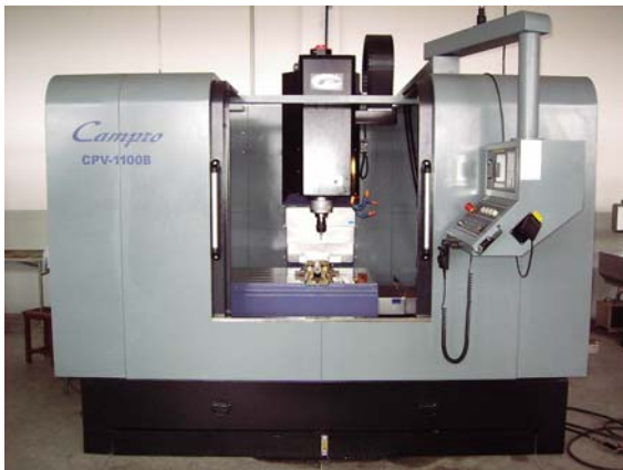
Numerical Control Center