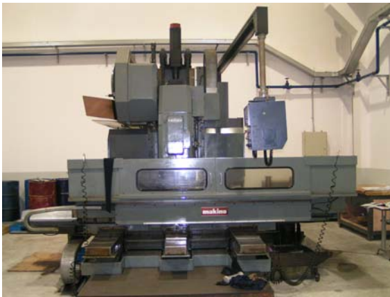
Numerical Control Center