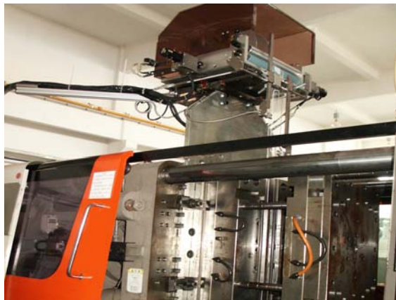
Foil feeding machine